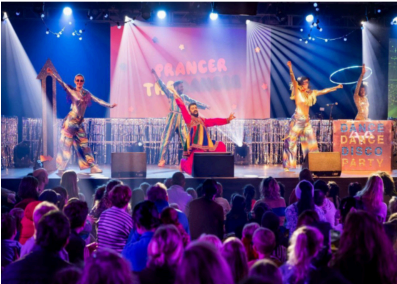
Image Description: Four performers are on stage doing the same dance move (with arms straight out at a quarter past eleven position on a clock). The other performer is spinning a light up hula hoop behind a DJ booth that says "DISCO PARTY FUN SHOW". The crowd is full and there is flashing lights and glitter slash curtain with a screen behind with text that says "Prancer the Dancer".

We are collaborative, bold, and joyful. We champion intersectionality, empowering artists, creatives and audiences.