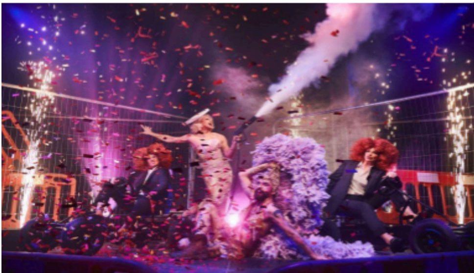
Image Description: Four performers are on a stage in various positions. Two at either side of the image are dressed in drag as Mick Hucknall and are on go karts. One on the left of the image is pulling a face akin to a grimace and the other is giving fashion. They are in large wigs and black suits with white shirts. One performer at the back of the image in the centre left is

We have also presented work by artists including Alok Vaid Menon , Mykki Blanco , Justin Vivian Bond and Kate Bornstein among many others..